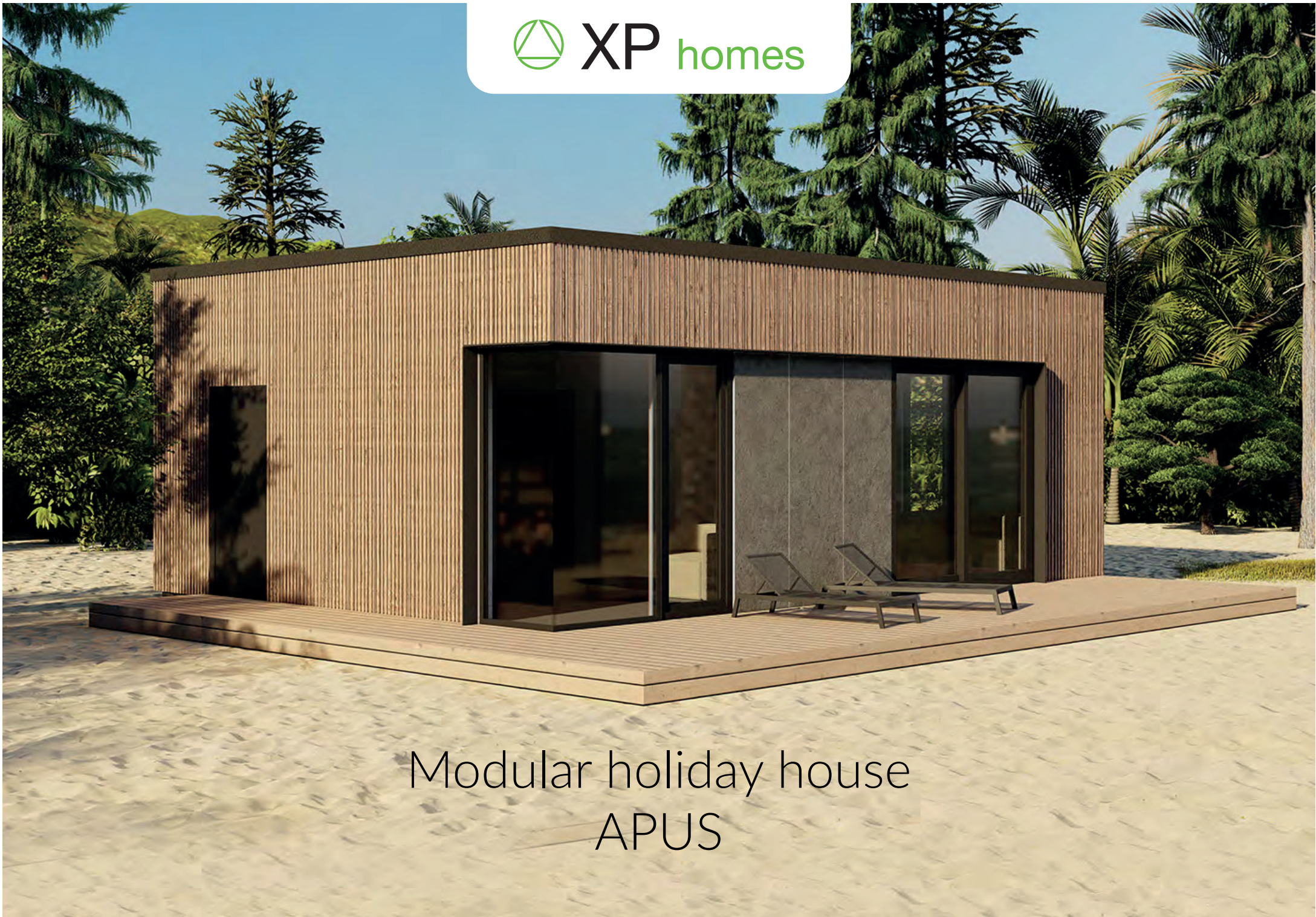
Modular holiday house APUS