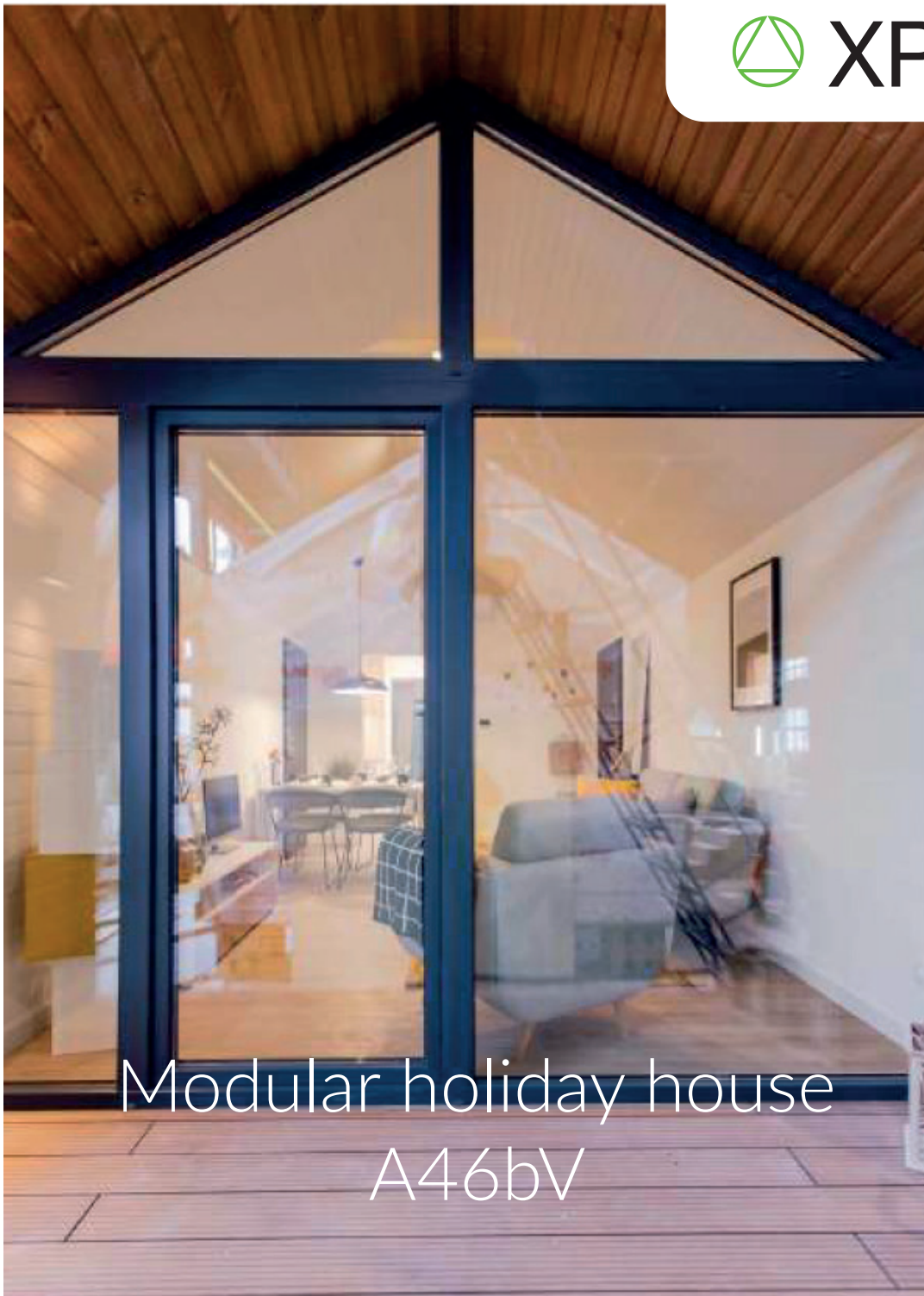
Modular holiday house A46bV