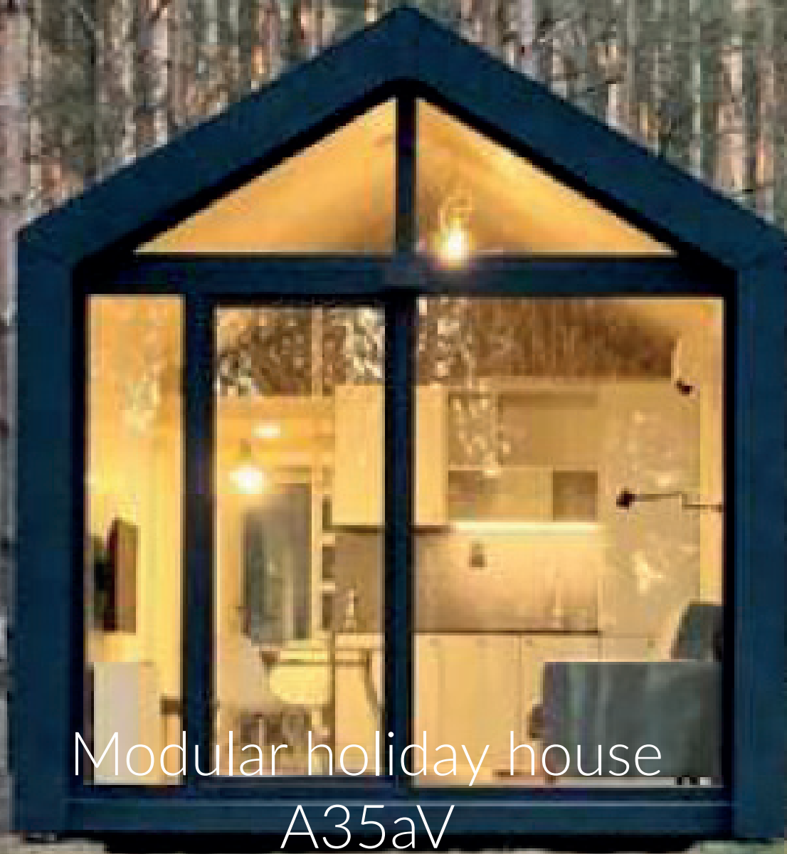
Modular holiday house A35aV